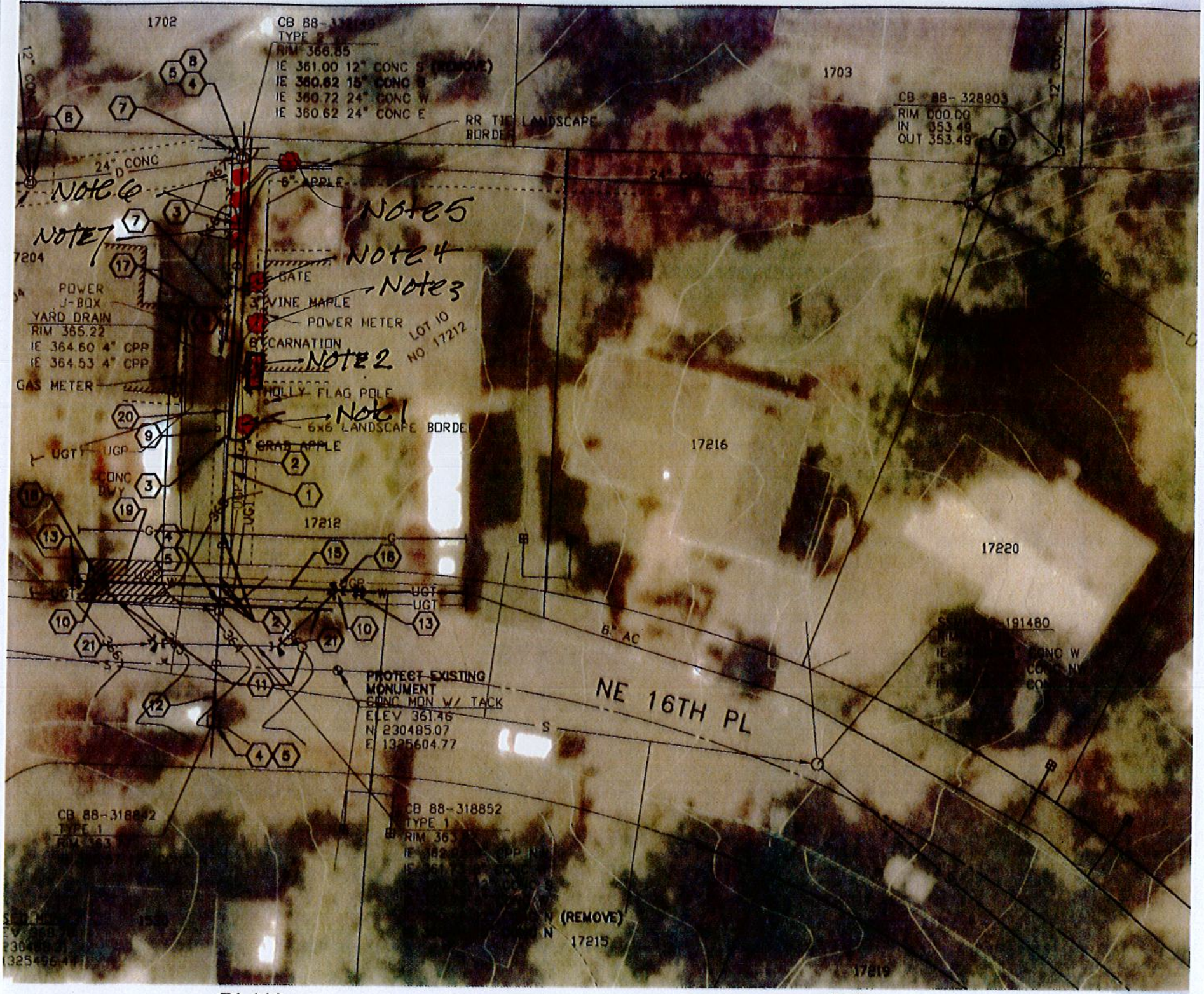
PLAN SCALE 1" = 20'